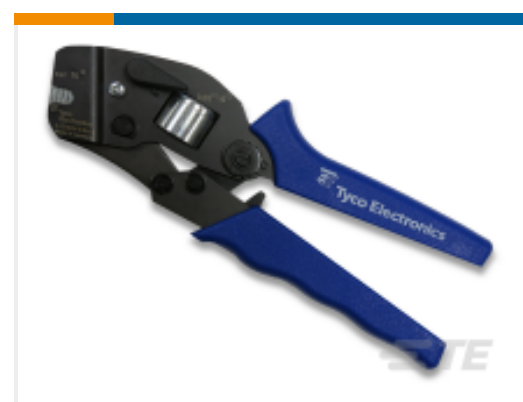
TE Part # 6-1579014-5 HT FOR CABLE-END SLEEVES FRONT 0,08-16