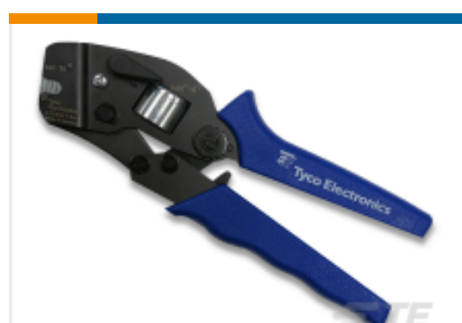
TE Part # 1SET191004R0000 FER-FL-HT