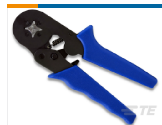
TE Part # 1SET191003R0000 FER-SE-HT