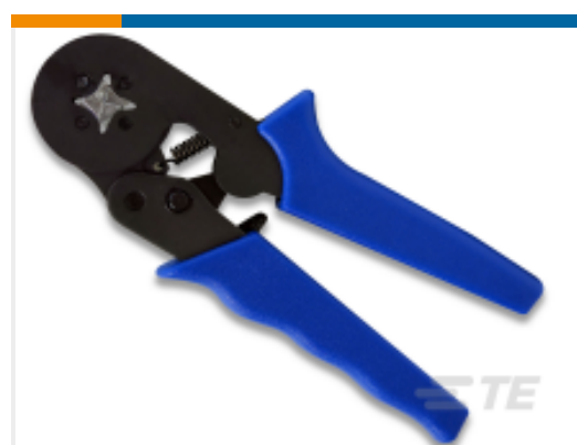
TE Part # 539660-1 ADERENDHUELSEN (Ferrule) Crimp Tool